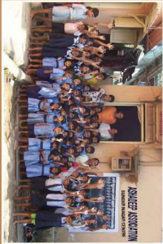
SUNDER NAGAR CENTRE