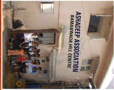
BAMANWADA HILL CENTRE