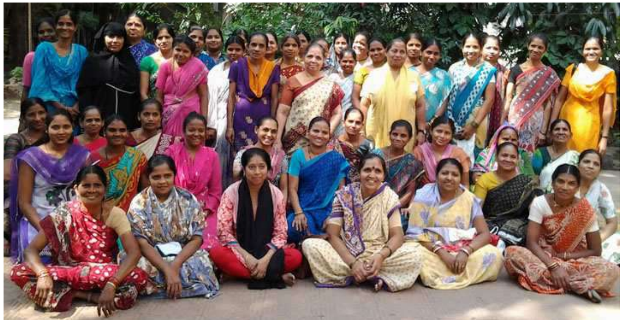
Parents and Children under the love and care of Ashadeep.