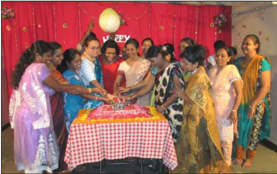
Centre Heads of all the 7 centres

c. Teacher's Day: The children planned and executed Teachers Day programme, at Sahar centre for all the teaching and non-teaching staff of Ashadeep. They presented a cultural programme followed by many games. The staffs were given small gifts as a token of love. All of them had a great time and it was a learning experience for all the children.