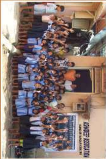
SUNDER NAGAR CENTRE