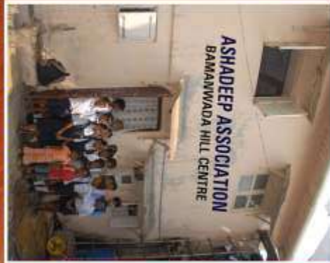
BAMANWADA HILL CENTRE