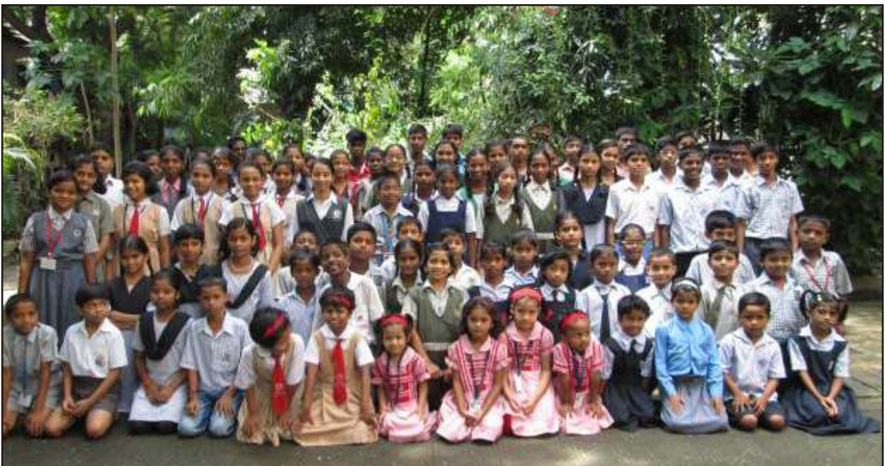
Children at Shakti Centre